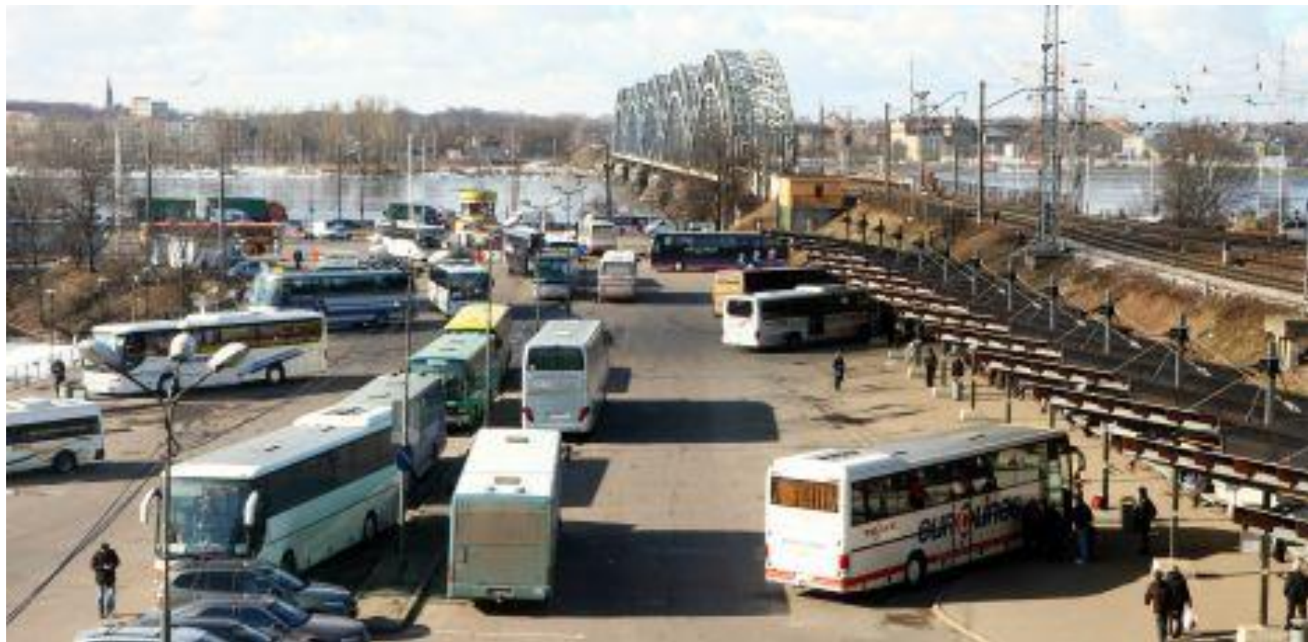
Autoosta – Bus Station