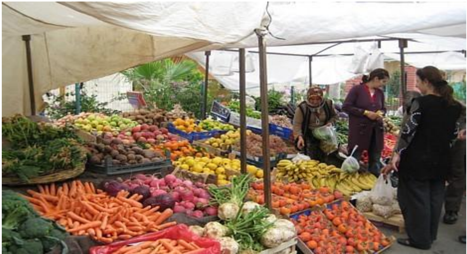
TIRGUS - MARKET PLACE